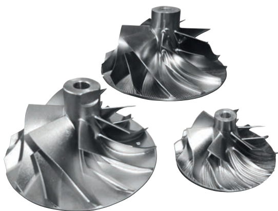
Electroless nickel plating by the DURNI-COAT® process gives wear and corrosion resistance to turbo charger compressor wheels made of aluminum.

The electroless nickel-plating (DURNI-COAT®) is carried out at our facilities according to DIN EN ISO 4527.