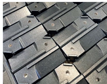
Release coating PlasmaCoat® on welding sheets.