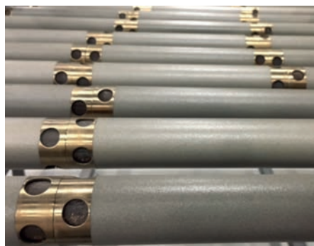
Friction enhancing non-stick coating PlasmaCoat® for transport rolls in the paper and textile industry.

With PlasmaCoat®, high-quality metal coatings and ceramic coatings are produced by thermal spraying. The highest surface hardness improves wear protection and extends the life cycle of mechanically highly stressed components. In addition, excellent non-stick properties or extremely wear-resistant anti-friction properties can be achieved with a topcoat. PlasmaCoat® coatings can be applied to almost all metallic materials and also to CFRP materials. PlasmaCoat® can also replace hard chrome coatings when mechanically reworked.