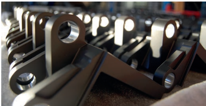
Volume flaps with TempCoat® as corrosion protection.

TempCoat® fluoropolymer coatings offer outstanding non-stick properties, anti-friction properties or high chemical resistance. Combinations of different properties are also possible. Both the use of special additives, such as graphite or molybdenum disulphide, and the multilayer structure including reinforcing layers, make it possible to adapt the layers specifically to the desired application. For example, multilayer, wear-resistant, non-stick systems improve demoulding processes or the excellent dry lubrication properties of anti-friction systems protect sliding components from failure.