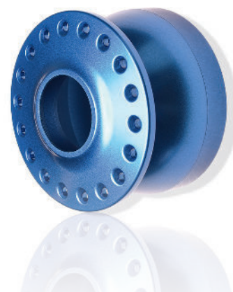
Component with blue colored NUCOCOMP® layer.